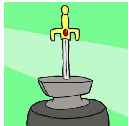
An inscription on the stone read, "Whoever pulls this sword from the stone is the true born King of all Britain."