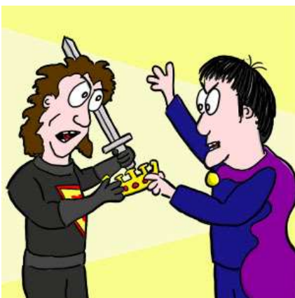
The other lords of the land fought as to who would become king.