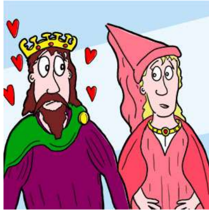
King Uther loved Igraine of Cornwall but he couldn't marry her.