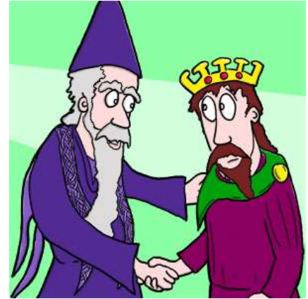
Merlin, the magician, said he would help if Uther gave him his first son.