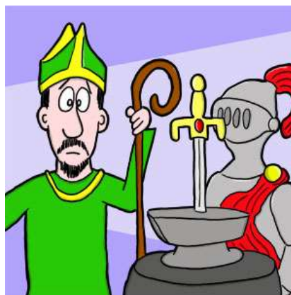
The Archbishop and Merlin called all the people to the church. A magical stone had appeared.