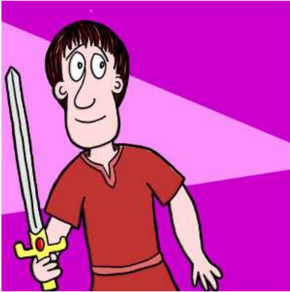
King Arthur and the Enchanted Sword