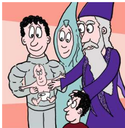
Merlin took Arthur and gave him to Sir Ector and his family to look after.