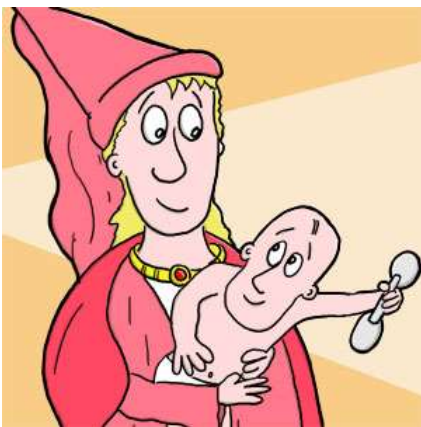
Uther and Igraine were married and they had a baby son, Arthur.